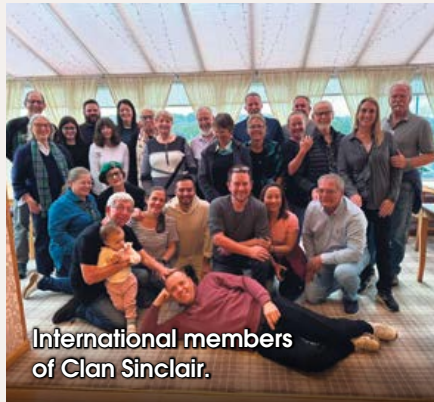
International members of Clan Sinclair.