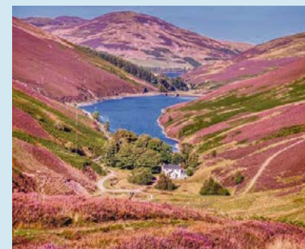
The Pentlands heather in full bloom.