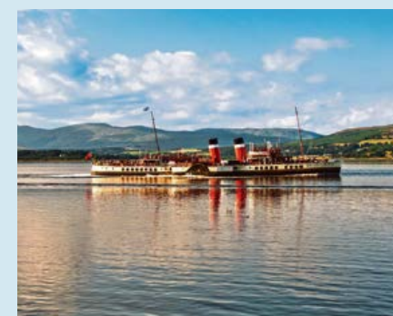
PS Waverley passing Port Glasgow. Mik Coia