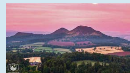
Recently I revisited the borders as there was forecast for a promising sunrise with fog and I was missing the rolling hills of the Borders. Well, what can I say, the Borders delivered, again! The colours were amazing and the fog rolled in quickly and it was almost a perfect morning.