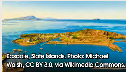
Easdale, Slate Islands.