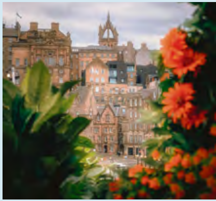
Edinburgh views...

Pose your questions on Scottish related topics to our knowledgeable readership who just may be able to help. Please keep letters under 300 words and we reserve the right to edit content and length. Letters can be emailed to info@scottishbsanner.com or online at www.scottishbanner.com/contact-us, alternatively you may post your letters to us (items posted to the Scottish Banner cannot be returned). Please ensure you include your full contact details should you require a reply. This page belongs to our readers so please feel free to take part!