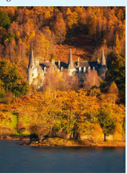
Tigh Mor Trossachs at Loch Achray beautiful autumn colours.

Pose your questions on Scottish related topics to our knowledgeable readership who just may be able to help. Please keep letters under 300 words and we reserve the right to edit content and length. Letters can be emailed to info@scottishbsanner.com or online at www.scottishbanner.com/contact-us, alternatively you may post your letters to us (items posted to the Scottish Banner cannot be returned). Please ensure you include your full contact details should you require a reply. This page belongs to our readers so please feel free to take part!