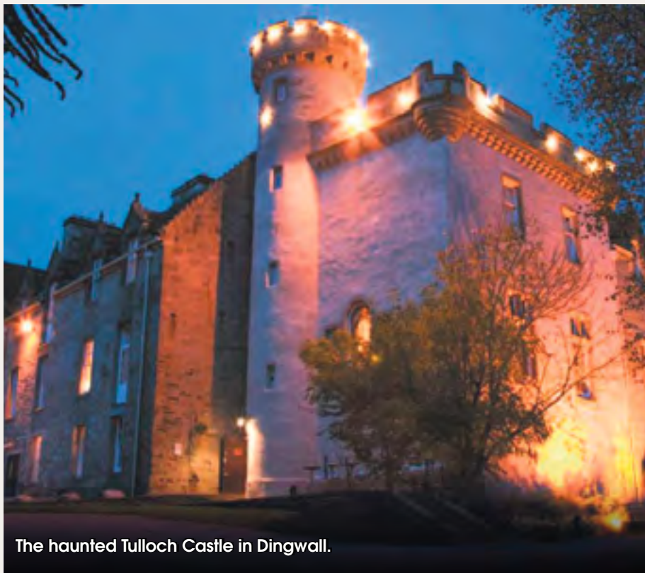
The haunted Tulloch Castle in Dingwall.

It's difficult to choose a favourite castle as they are all beautiful in their own way, the derelict ones would have so much to tell if they could only talk, if it's a Scottish castle I love it!! I can't leave Tulloch Castle and room 8's friendly?? ghost. My daughter and I stayed there twice and he made his presence known both times. I was interested in the oystercatcher on the back page, in Australia they are called a pied oystercatcher and we also have a black one, the sooty