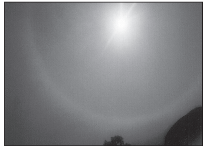
Rainbow around the Sun at the Glen Innes Standing Stones in Australia

On looking at your photographs regarding the highland gathering at Glen Innes this year and on the front cover the Ring of Brodgar in the Orkney's, I was reminded about what happened at last years festival at Glen Innes. In the middle of the Standing Stones the ceremony of the Kirkin of the Tartans or the blessing of the tartans was taking place on the Sunday after noon and an Irish priest invited everyone to say the lords prayer in what ever language they wanted as there were lots of different celts there from different countries. It was a lovely bright sunny